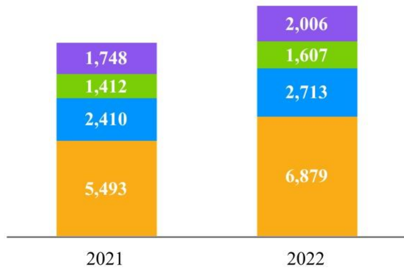
Revenue by sales channel $ in millions